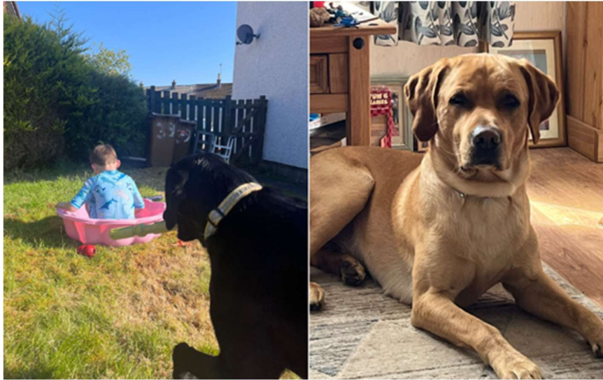
Figure 2: Feeling safe(r)

The shared commitment to creating better mental health for children and families is a galvanising force. Whilst there are still much to be done, there is now greater recognition of neurodiversity amongst children in schools, social and traditional media, and community groups. There is also more knowledge about Adverse Childhood Experiences, of children’s mental health issues and better recognition that parental mental health has an impact on children.